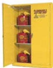
4510 2-Door Self Closing