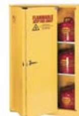
1945 Sliding Door Self Closing 30 & 45 gallon only