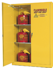
4510 2-Door Self Closing