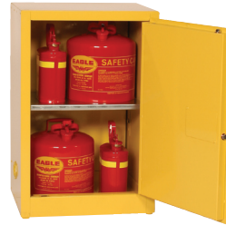
Flammable Storage Cabinets