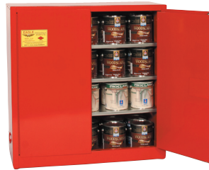
Paint/Ink Storage Cabinets