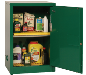
Pesticide Storage Cabinets