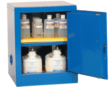
Acid/Corrosive Storage Cabinets