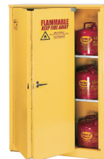
1945 Sliding Door Self Closing 30 & 45 gallon only