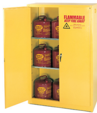
1947 2-Door Manual Close