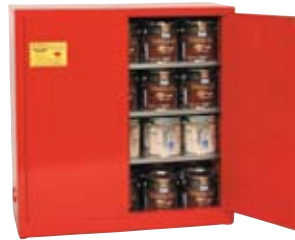
Paint/Ink Storage Cabinets