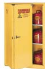
1945 Sliding Door Self Closing 30 & 45 gallon only