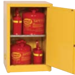
Flammable Storage Cabinets