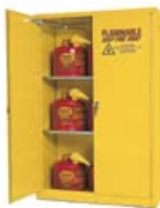
4510 2-Door Self Closing