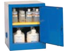
Acid/Corrosive Storage Cabinets