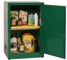
Pesticide Storage Cabinets