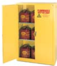
1947 2-Door Manual Close