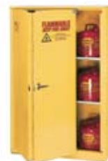
1945 Sliding Door Self Closing 30 & 45 gallon only