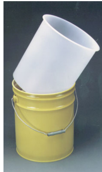
PAIL LINER EXAMPLE

Our main warehouse stocks thousands of liners for immediate shipment!